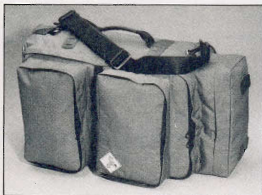
This EMS "Porter Pack" converts from a large suitcase to a full-sized backpack.

for the trip and the common starting point is to prepare for eight to ten days of camping out with adequate but minimal provisions and supplies for the number of people in your group.