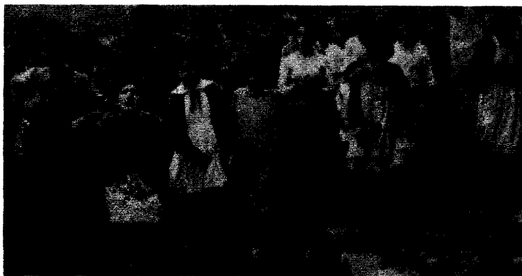
Loli, only one in ecstasy, holds Conchita's left hand, Mari Cruz's right hand. Jacinta holds Mari Cruz's hand. Loli is in full ecstatic flight around corner of Conchita's house. Extended arms, inclined torso and sharply raised left leg indicate acceleration of her pace. Some marches were so fast spectators could hardly keep up with girls.